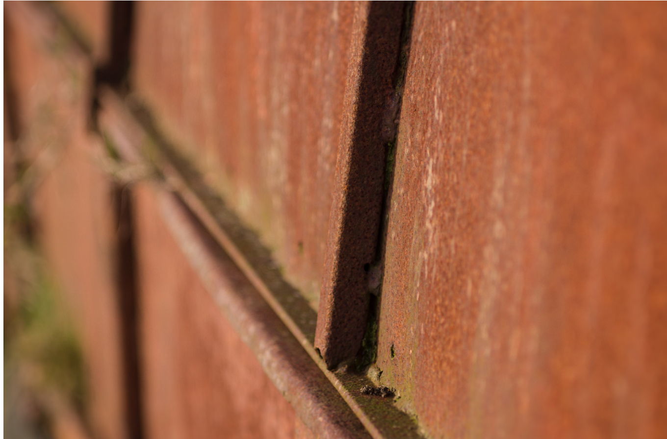
Tamron SP90 90mm F2.5 1/350th iso 80

The final image is that trailer again where the wall lent itself to black & white The Earthy tones of rust demand colour.