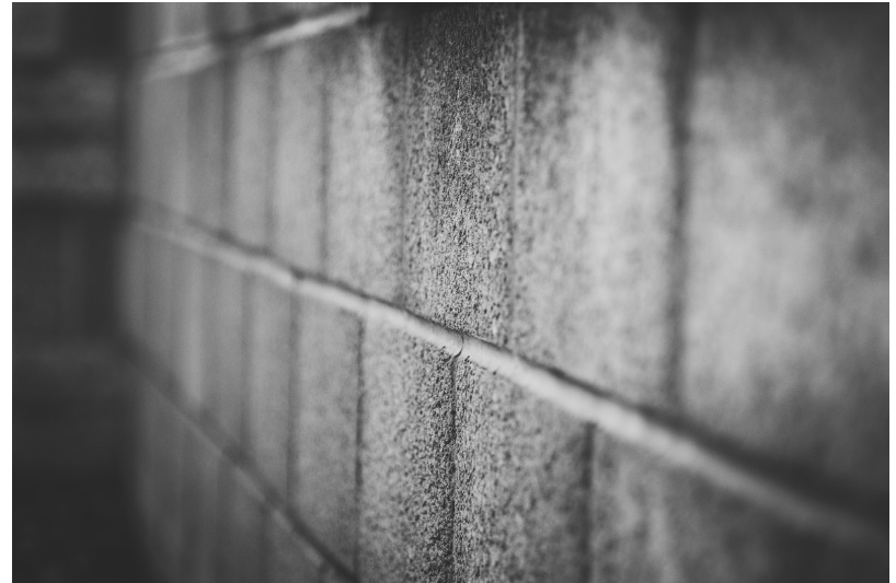
Tamron SP90 90mm F2.5 1/750th iso 80 -2EV