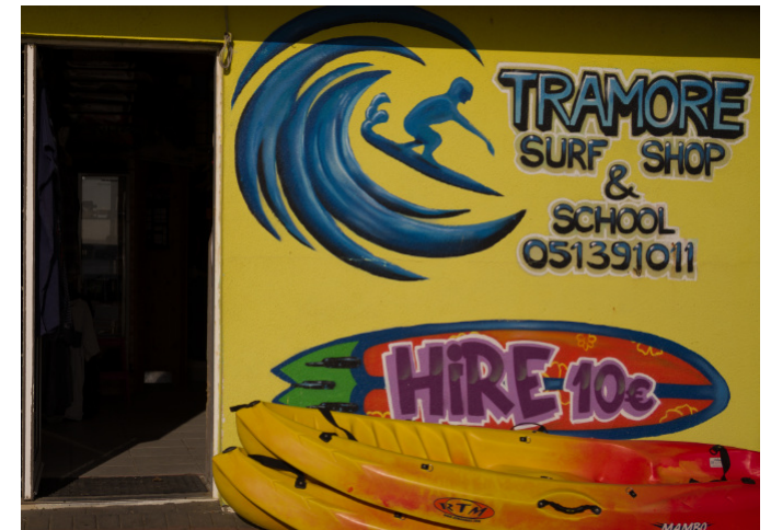
C3 Pentax Da 18-55mm at 35mm F5.6 1/2000 -1ev

liked the strong bold colours and the bit of mystery about what was within the dark doorway.