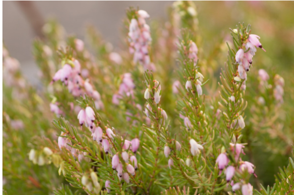
Tamron SP90 90mm F2.5 1/90th iso 80 -2EV

The biggest colours of all must be flowers