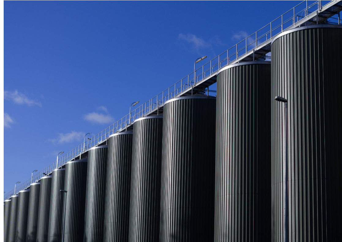
C9 Pentax 18-55mm @ 38mm f8 iso 80 1/350 th

This was so close to being two colours with the blue of the sky contrasting the green Towers.