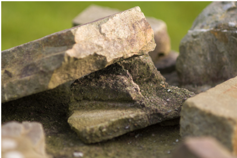
Tamron SP90 90mm F2.5 1/750th iso 80 -2EV