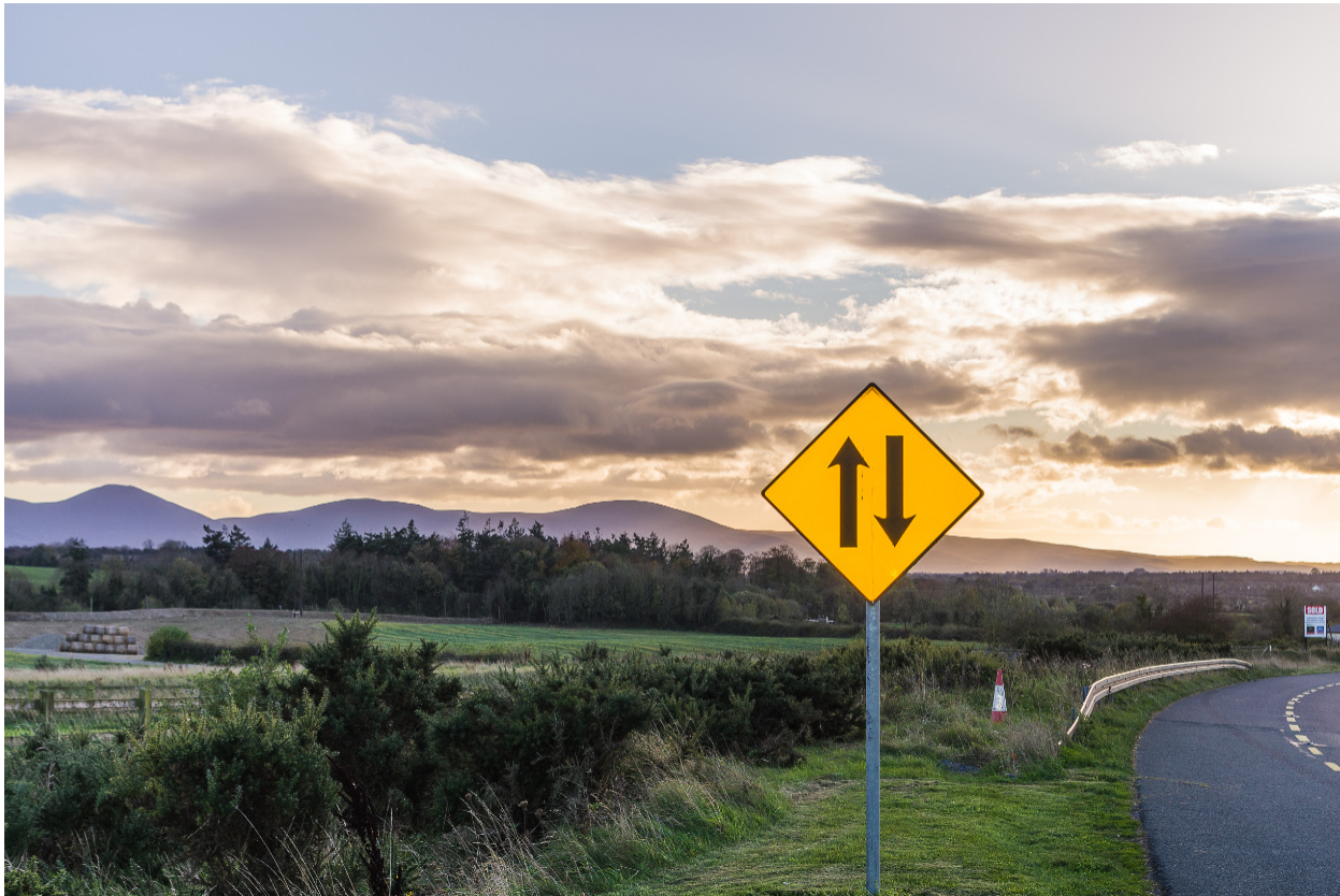
C6 Pentax 18-55mm @ 40mm f9.5 iso 80 1/180 th with Flash

With this Photograph I decided to try something a little different. I used camera flash to bring up the intensity of the sign.