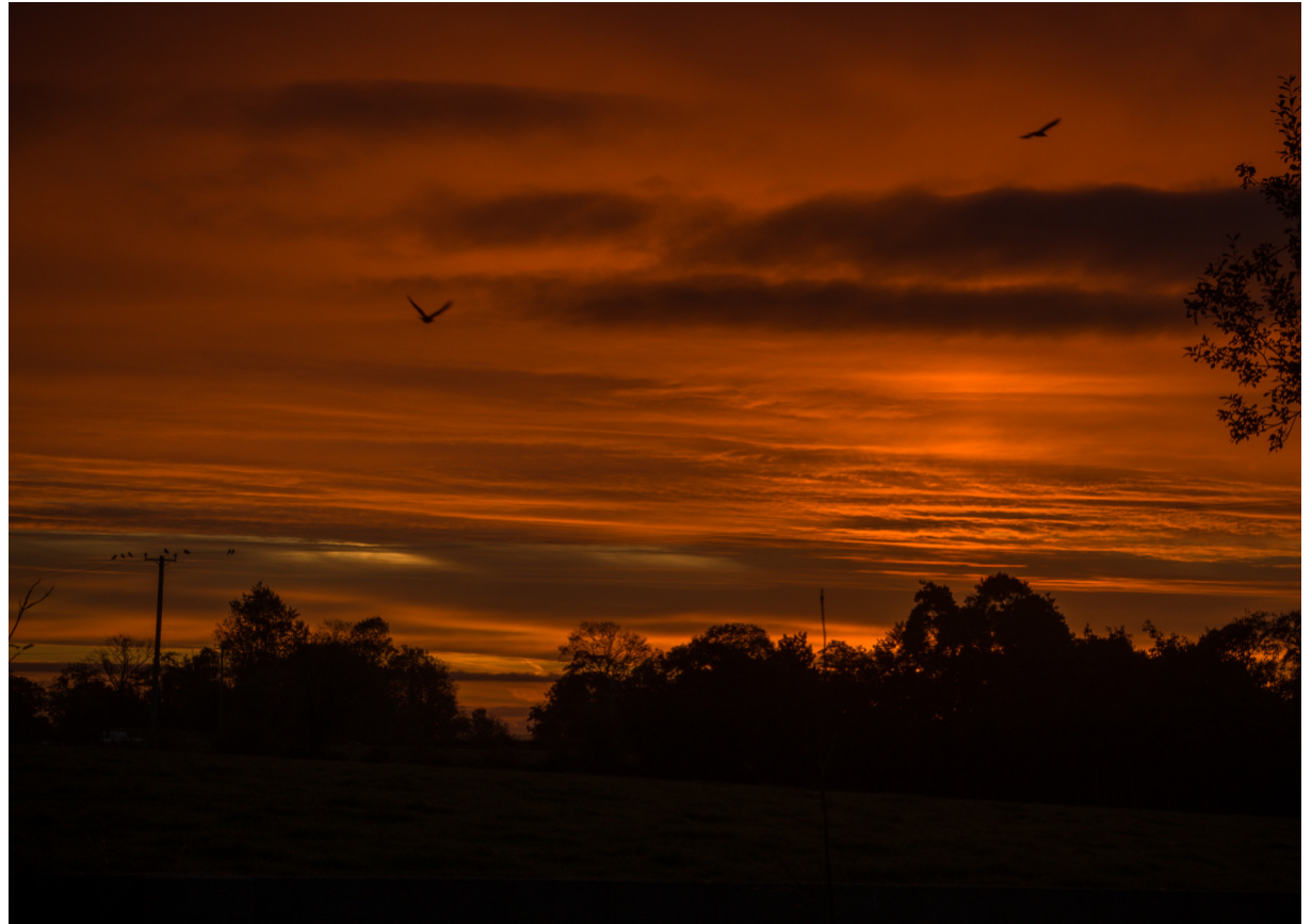
C1 Pentax 18-55mm @ 55mm f8 iso 80 1/125 th -2EV

This was one of the first that attracted me the fiery orange of the dawn makes this for me.