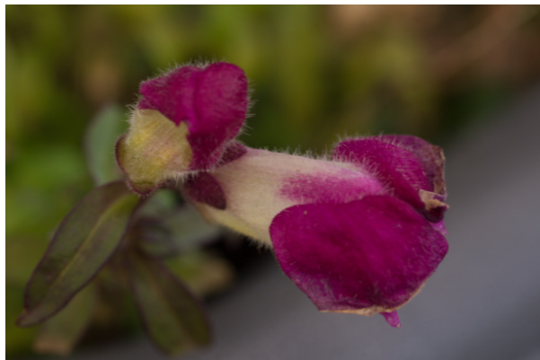
Tamron SP90 90mm F2.5 1/60th iso 80 -2EV

The final image is that trailer again where the wall lent itself to black & white The Earthy tones of rust demand colour.