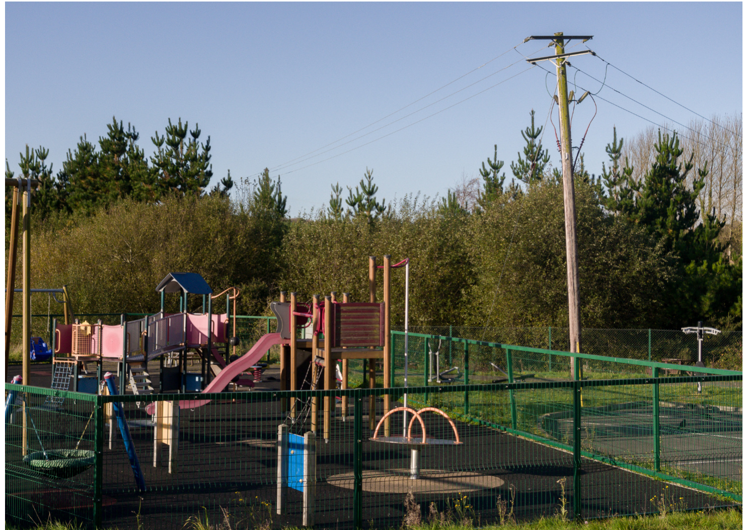
C4 Pentax Da 18-55mm at 35mm F5.6 1/1500 -2ev

William Eggleston was also in mind when I took this photograph of a run down playground, it was early morning and no one around. Which is just as well since people tend to be suspicious especially when there are young children around.