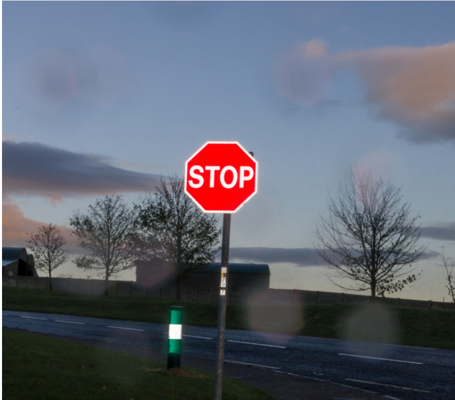
C8 Pentax 18-55mm @ 35mm f32 iso 80 1/60 th

This used the same flash technique as with the previous sign there was a little rain as I took this photograph.