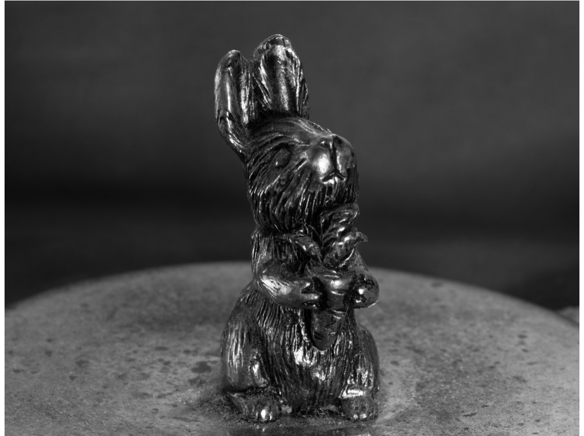
SL1 Tamron SP90mm lens 6 seconds iso 80 f2.8

The way the rabbit is designed its most appealing angle was with my camera above and looking down. I didn't like the white balance in colour and decided it worked best in black & white for a silver subject. I experimented with different angles on the subject and this I thought was most appealing.