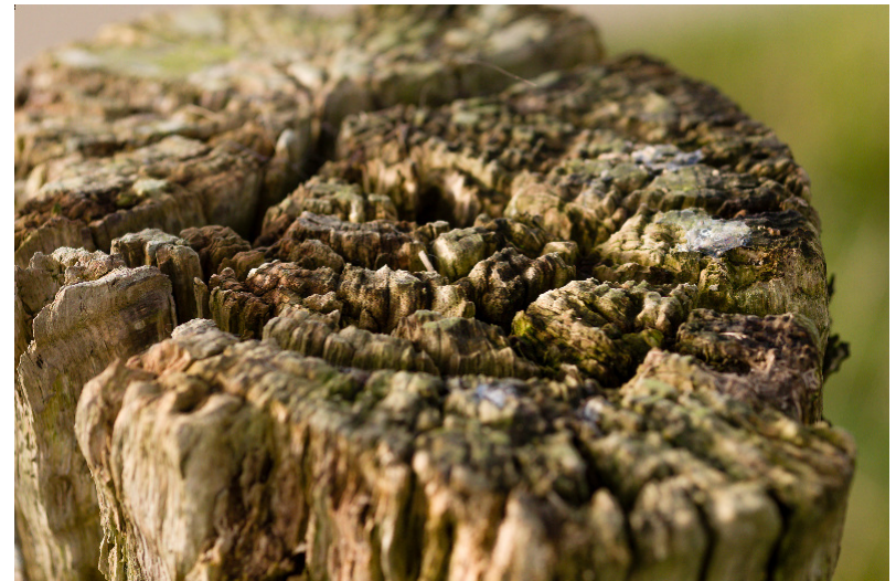
Tamron SP90 90mm F2.5 1/500th iso 80 -2EV