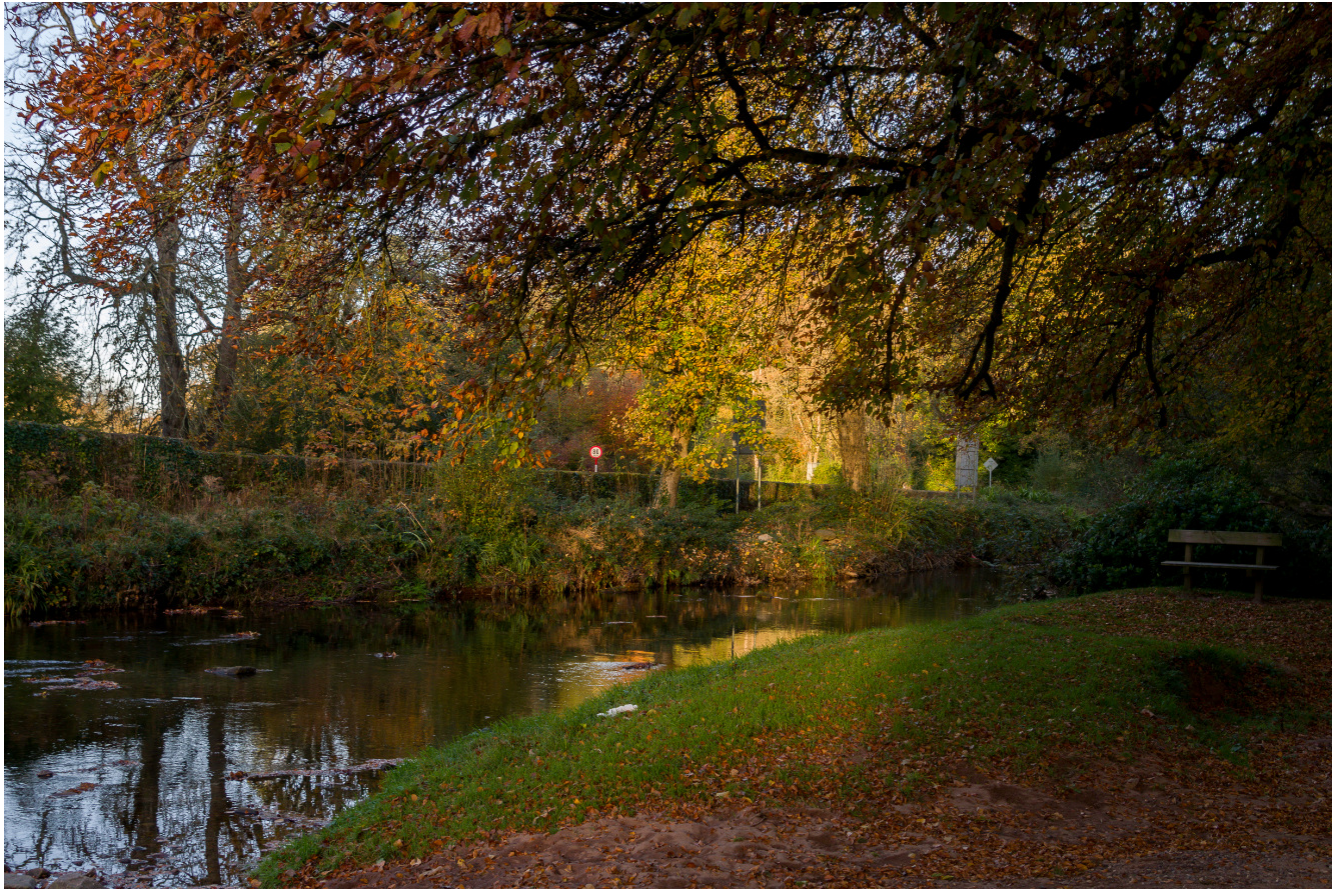
C2 Pentax 18-55mm @ 28mm f8 iso 200 1/90 th

This next photograph it was the golden dawn light