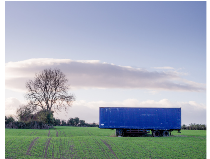
C7 Pentax 18-55mm @ 40mm f9.5 iso 80 1/250 th

With this shot the blue slab was making the colour statement.