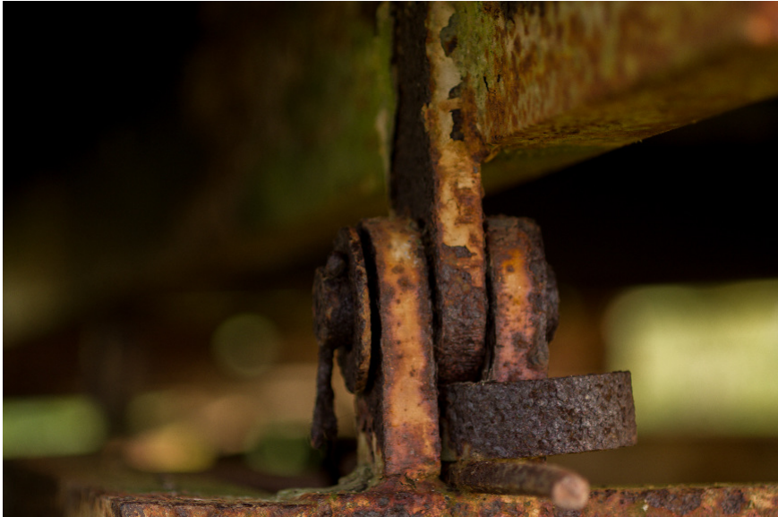
Tamron SP90 90mm F2.5 1/125th iso 80 -2EV

Living in a rather rural part of Ireland my Local Environment is more natural than man made.