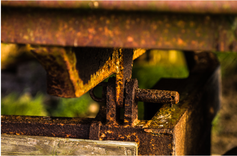
Tamron SP90 90mm F2.5 1/350th iso 80